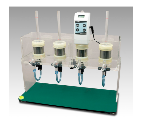
Let's update the analog to digital!